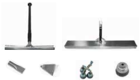
GEYSER 10 BAR Steam 183°C