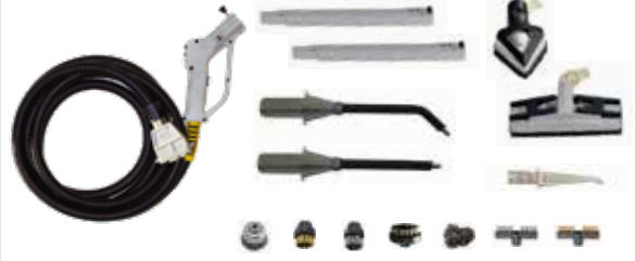
JULY 10 BAR Steam 183°C