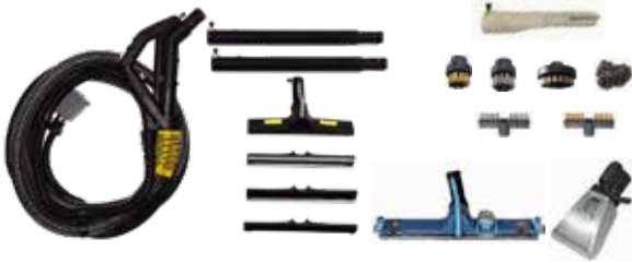
RADAMES 10 BAR Steam & vacuum 183°C